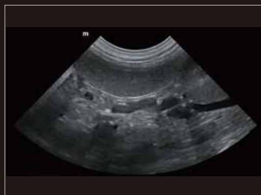
Spleen of canine