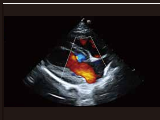
Cardiac blood flow of canine