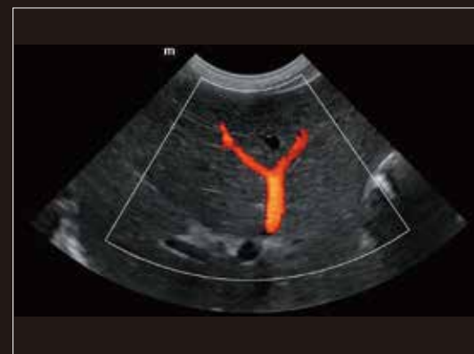
Portal Vein of canine