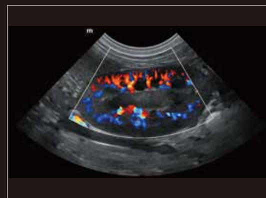
Renal blood flow of canine