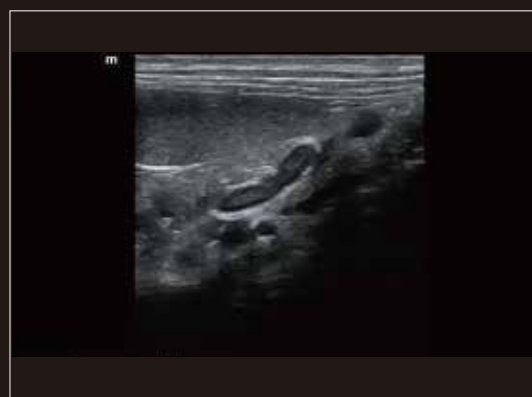
Adrenal gland of canine