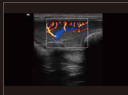
Spleen blood flow of canine