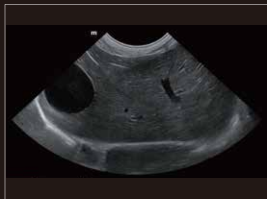
Liver and gallbladder of canine