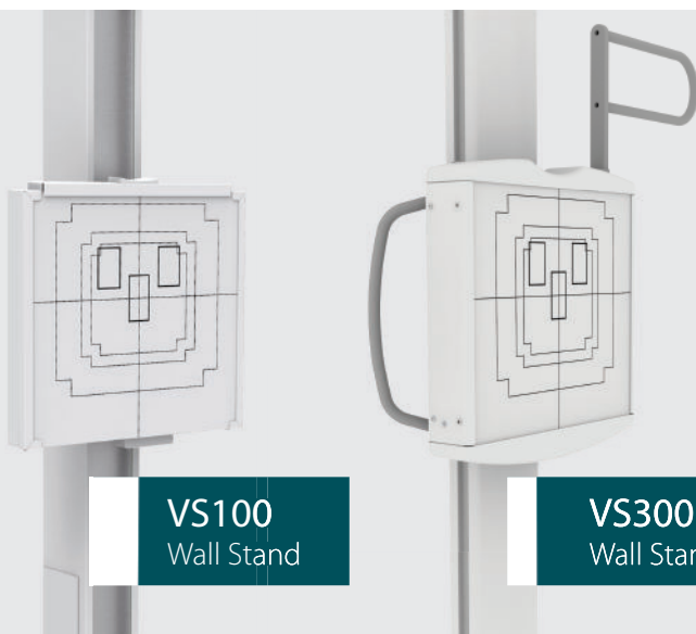
VS100 Wall Stand